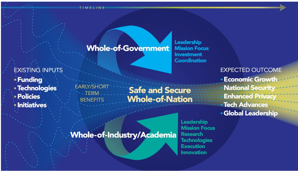
Figure 1: Conceptual model of whole-of-nation focus towards defined Cybersecurity Moonshot Initiative objectives.

Based on a collation of findings across multiple briefings, the NSTAC developed the graphic below to conceptually visualize how a shared understanding of distributed roles, responsibilities, and strategic vision can help focus—not limit or stifle—targeted innovation towards defined areas that can lead to a more fundamentally safe and secure Internet. Conceptually, this includes top-down pressure from the highest levels of the U.S. Government to define strategic intent, and upward pressure from the operational engines of the private sector and academia that are actively defining innovation priorities and leading progress.